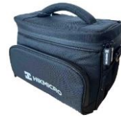
M/G/SP Series Pouch HM-SP01-POUCH

COMPLIANCE NOTICE: The thermal series products might be subject to export controls in various countries or regions, including without limitation, the United States, European Union, United Kingdom and/or other member countries of the Wassenaar Arrangement. Please consult your professional legal or compliance expert or local government authorities for any necessary export license requirements if you intend to transfer, export, re-export the thermal series products between different countries.