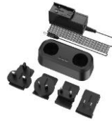
M Series Charging Base HM-5202ZC